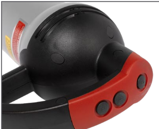
2 speed option