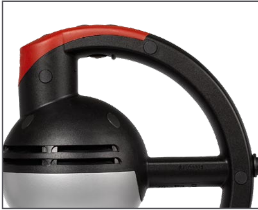
Ergonomic handle design