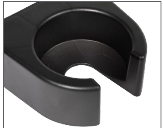
Wall mounting cradle