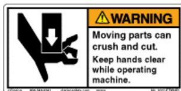
Cut Hazard #L229