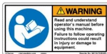
Read Manual #L228