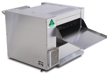
ET315 showing rear pass through chute. ET310 looks identical.