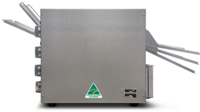
ET315 showing front chute and rear chute at adjustable angles. ET310 looks identical.