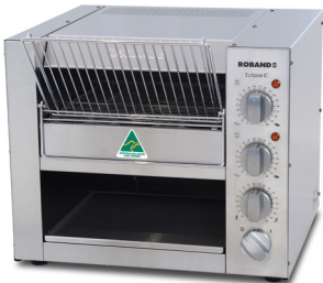
ET315 pictured. ET310 looks identical.