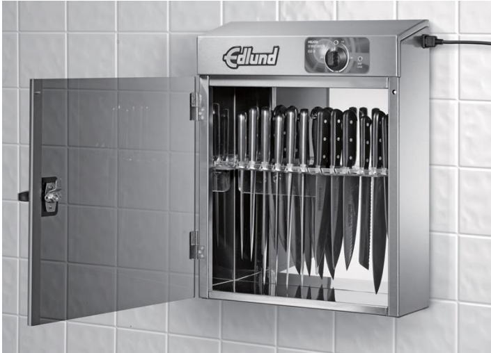
UV KNIFE SANITIZER, Model KSUV-18