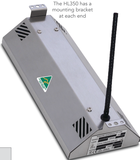
The HL350 has a mounting bracket at each end