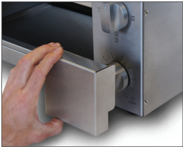
Speed controller cover

*Variations may occur depending on voltage supply and bread product