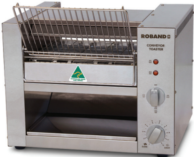
TCR15 pictured TCR10 looks identical