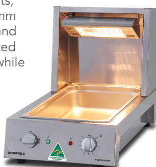
MW10 Base Unit

Supplied without accessories or trays. Fits various gastronorm pan layouts, including a full-size 1/1 (100 mm deep) pan. With heat above and below, the MW10 keeps cooked food at serving temperature while displaying it attractively.