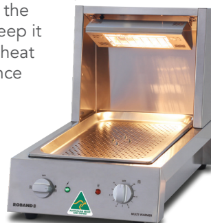
MW10CS Carving Station

Supplied with a 65 mm full-size pan and a 25 mm perforated spiked pan for carving. The spiked tray holds meat securely, while the lower pan provides steam to keep it moist and collect drippings. A heat lamp adds warm light to enhance presentation.