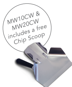
MW10CW Chip Warmer

Supplied with a sloping chip tray, the MW10CW and MW20CW boost chip productivity and presentation. With heat from above and below, they keep chips at serving temperature and free the fryer basket for the next batch. The heat lamp adds warmth and a light that enhances presentation.